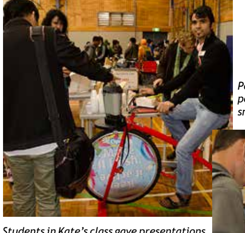
Pedal powered smoothies!