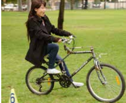
Bike races on crazy bikes!